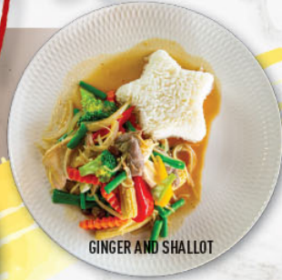
GINGER AND SHALLOT