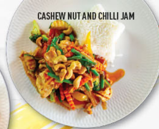
CASHEW NUT AND CHILLI JAM