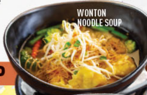
WONTON NOODLE SOUP