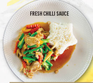
FRESH CHILLI SAUCE