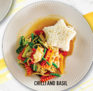
CHILLI AND BASIL