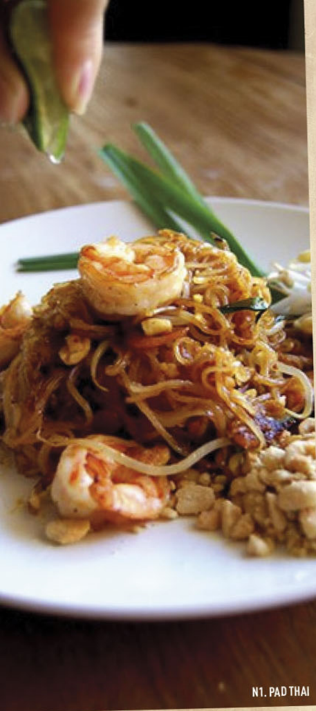
N1. PAD THAI