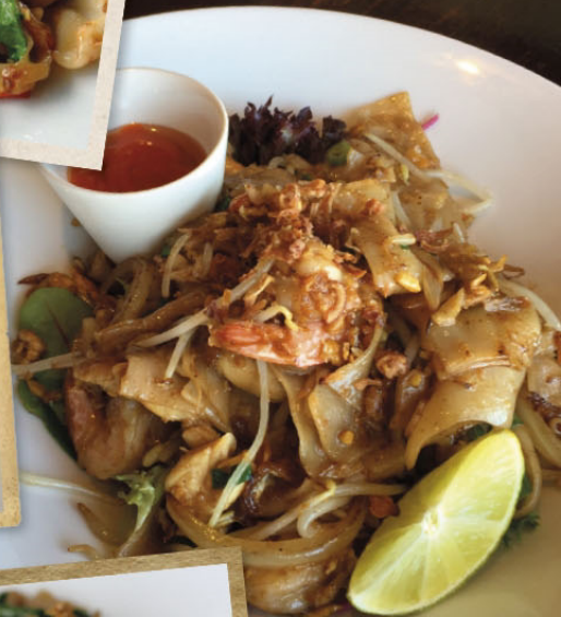
N10. KUA KHAI NOODLE