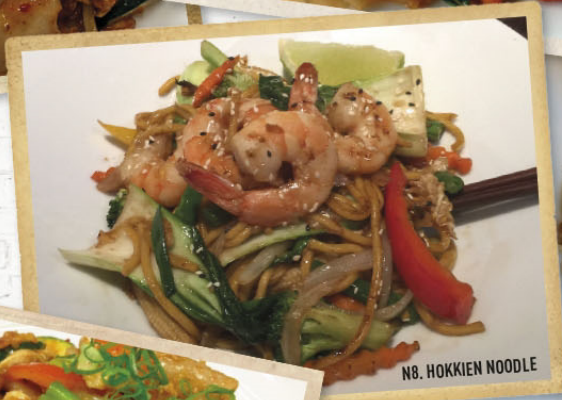
N8. HOKKIEN NOODLE