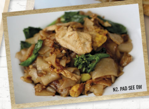
N2. PAD SEE EW