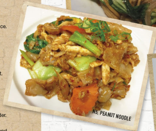
N5. PEANUT NOODLE