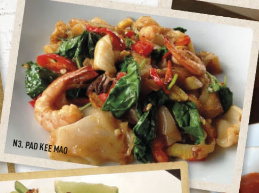
N3. PAD KEE MAO